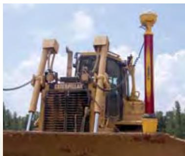
3D Grade Control with Laser Augmentation

No more long walks up grade. By remotely changing and reading grade information, you can speed setup and reduce costly communication errors.